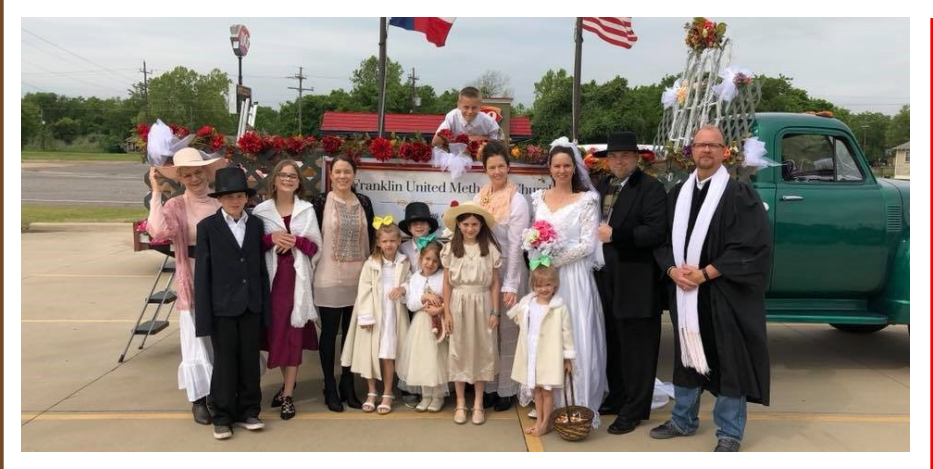
A HUGE THANK YOU TO ALL WHO PARTICIPATED TO CREATE A BEAUTIFUL FLOAT AND REPRESENT OUR AMAZING CHURCH AT THE