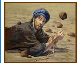
Stoning of St. Stephen