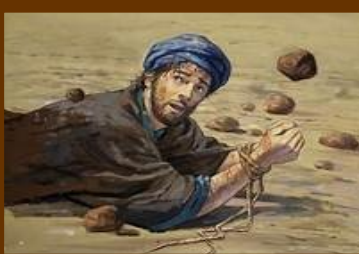
Stoning of St. Stephen

Please keep all attendees in your prayers.