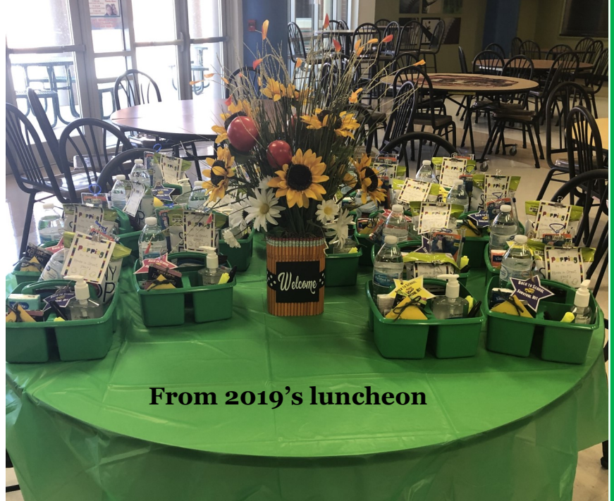
From 2019's luncheon