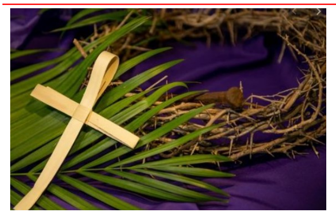
Prelude and Entrance of Acolytes

Sunday Morning Worship online at~http://umc-franklin.org/sunday-morning-worship