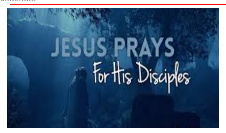
Prelude and Entrance of Acolytes

Sunday Morning Worship online at ~http://franklinmethodist.org/sunday-morning-worship