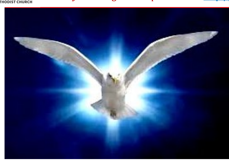
Prelude and Entrance of Acolytes

Sunday Morning Worship online at ~http://franklinmethodist.org/sunday-morning-worship