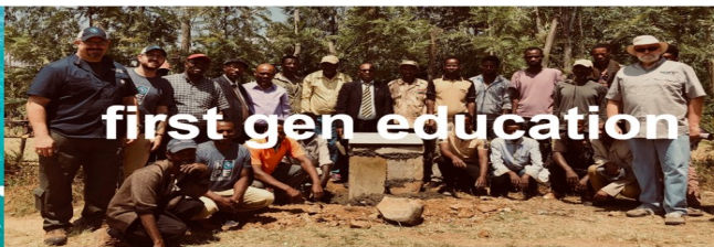
The Kondala School

After years of building partnerships and community through the installation of water filters, we began work on the Kondala School. A joint dream between Hope Missions and the village of Kondala Ethiopia